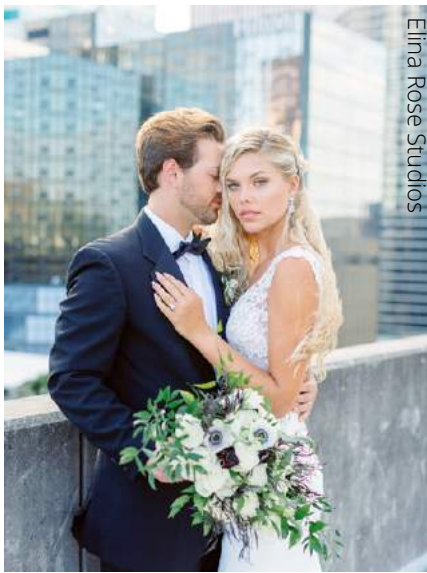
Elina Rose Studios