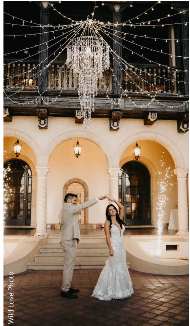
Wild Love Photo

Fun, enthusiastic, caring, honest, organized, empathetic, and detail-oriented