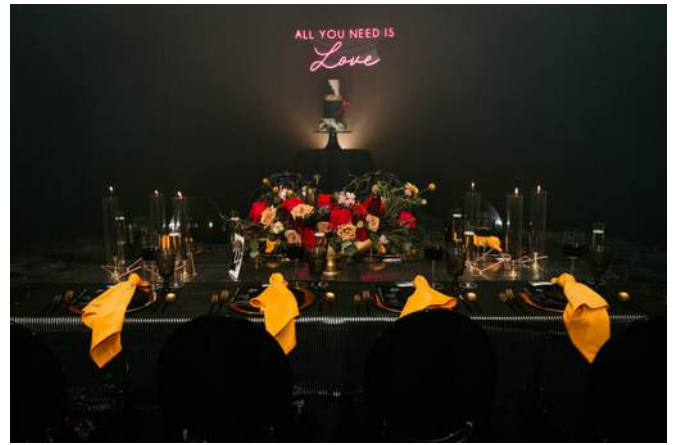
Bonnie Newman Creative

My ideal client is sarcastic and may drop the occasional "f-bomb."