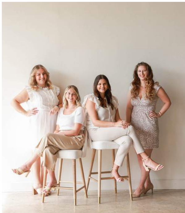
The Breezin' Team

We're not just here to assist; we become your personal guides. With us by your side, our couple's big day becomes stress-free and perfect—just the way they've imagined!