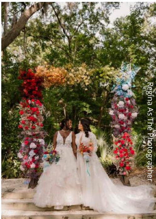
Regina As The Photographer