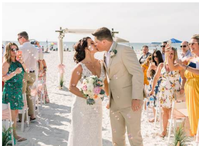
Love and Covenant

GULF BEACH WEDDINGS, THE INDUSTRY LEADING DESTINATION BEACH WEDDING COMPANY, FOCUSES ON SIMPLE AND AFFORDABLE, YET ELEGANT CEREMONIES.