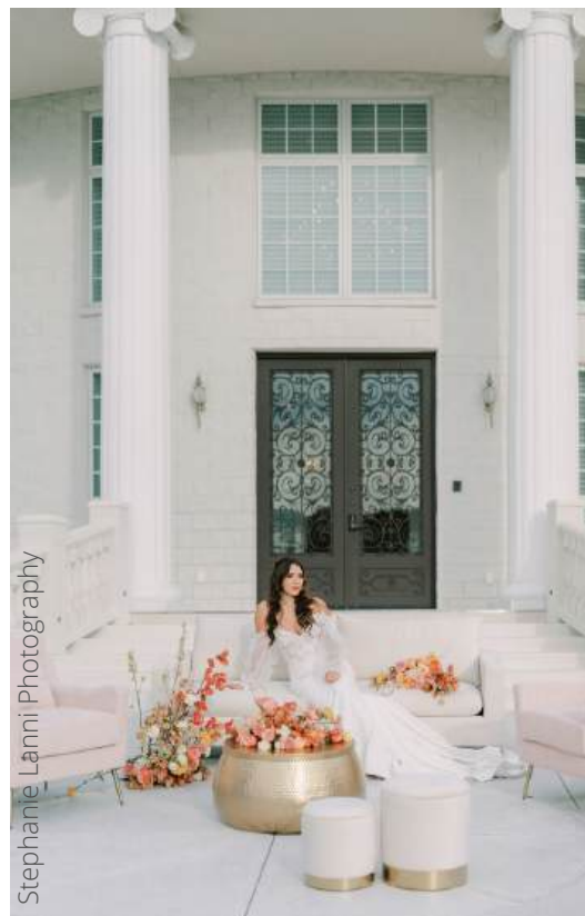
Stephanie Lanni Photography

Our backbone of pure passion. Not only do I adore planning weddings, but having a huge motivational inspiration makes each and every celebration extra special.