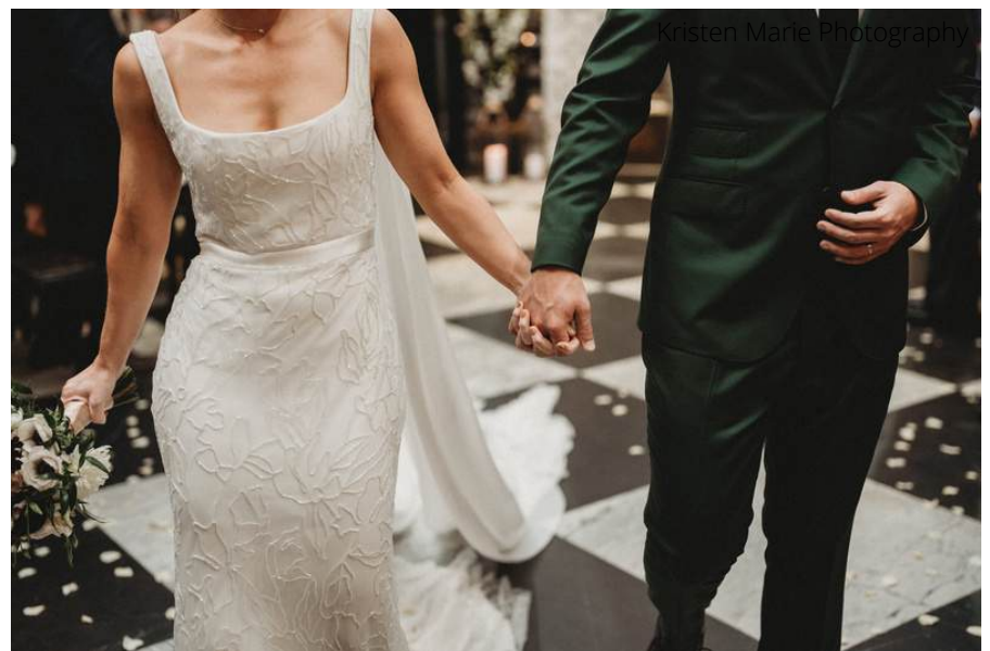
Kristen Marie Photography

(727) 343-0800 @SPECIALMOMENTEVENTS TAMMY@EVENTSBYSPECIAL MOMENTS.COM