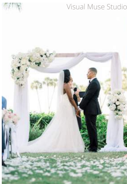
Visual Muse Studio

"Think of us as the friend who loves to chat about your wedding details all the time!"