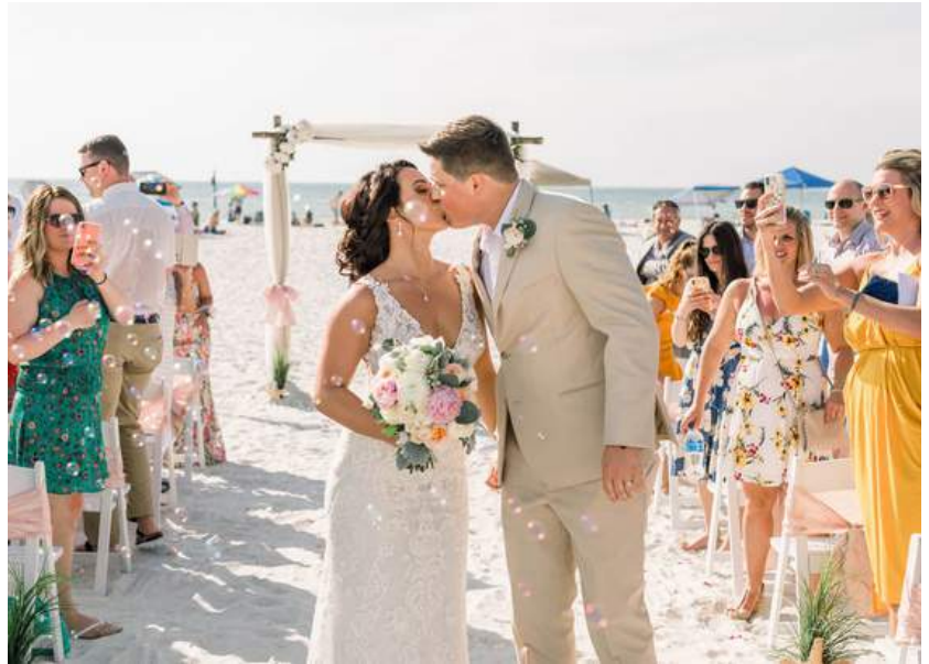
Love and Covenant

(727) 475-2272 INFO@GULFBEACHWEDDINGS.COM @FLORIDABEACHWEDDING