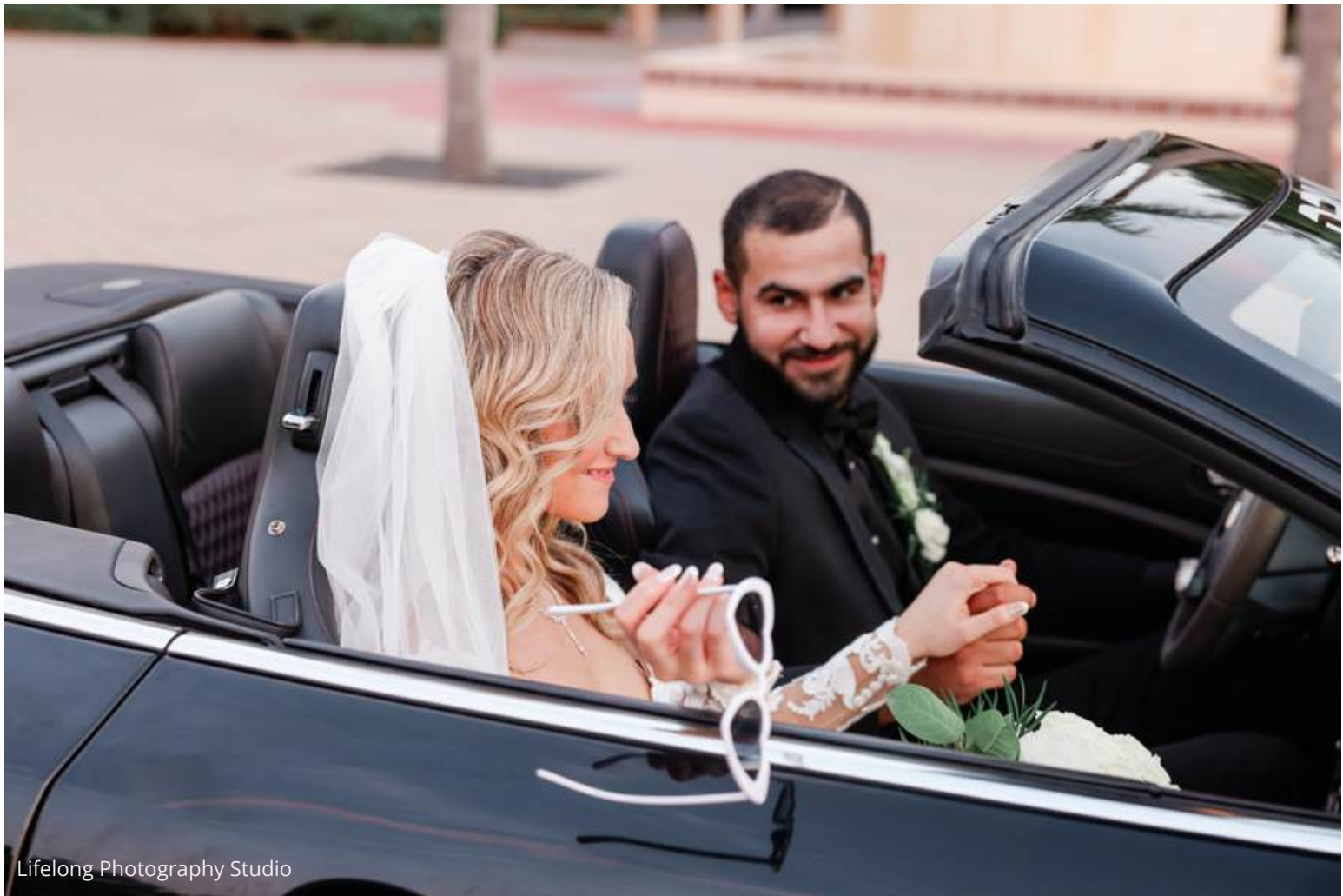
Lifelong Photography Studio