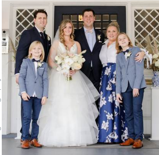
Lifelong Photography Studio