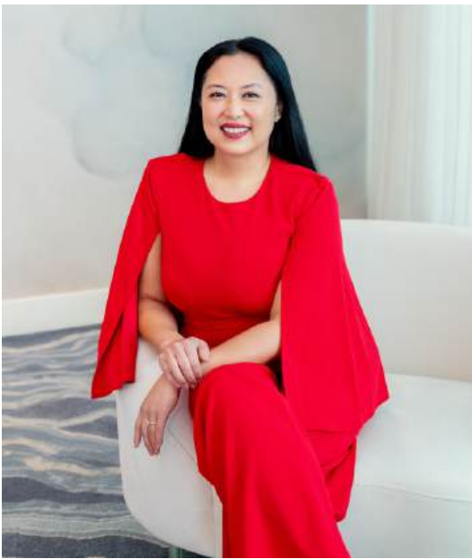
Pine and Forge